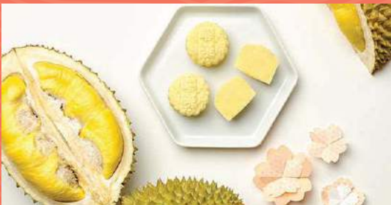
Mini Gula Melaka Snowskin Mooncakes

Luscious durian pulp encased in a pillow-light snowskin.