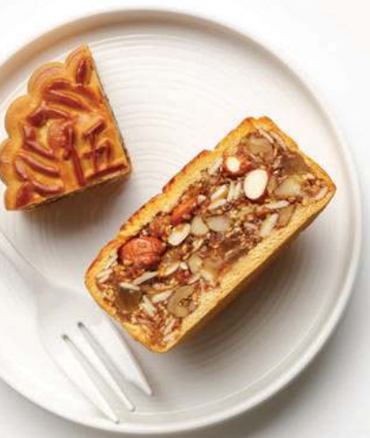
Traditional Mixed Nuts