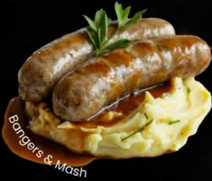
Bangers & Mash